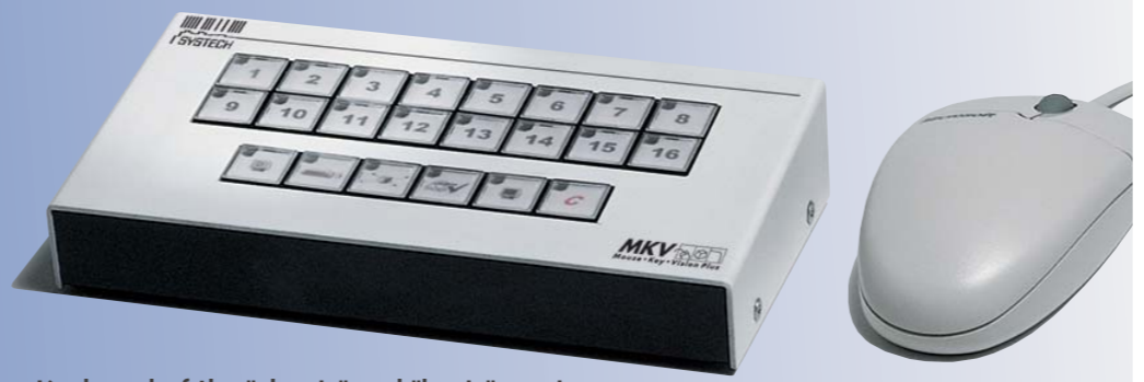
Keyboard of the "classic" and "basic" versions

For customers who do not make full use of the MKVision plus comfort version for their computer training, Systech offers the "classic" and "basic" versions. The table below gives an overview of the functions available with each version.