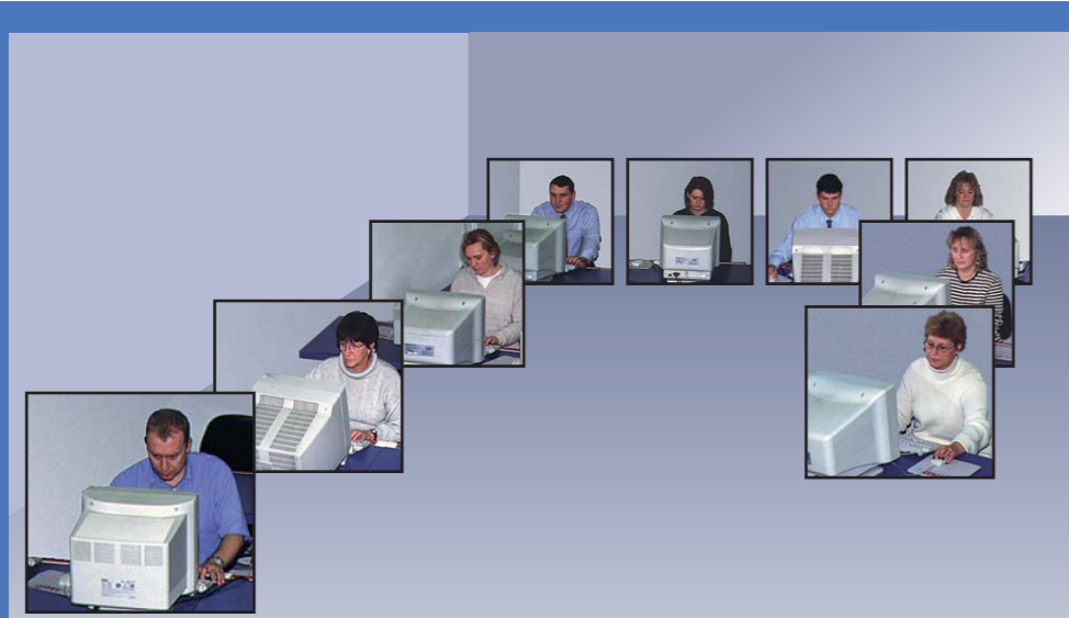
Classroom organisation: e.g. the students' workstations are grouped to form a "U" as are the keys on the keyboard.

The keys can be arranged in the MKVision plus keyboard so as to reflect the classroom situation. Your advantage: the location of workstations can be identified by a quick glance at the keyboard.